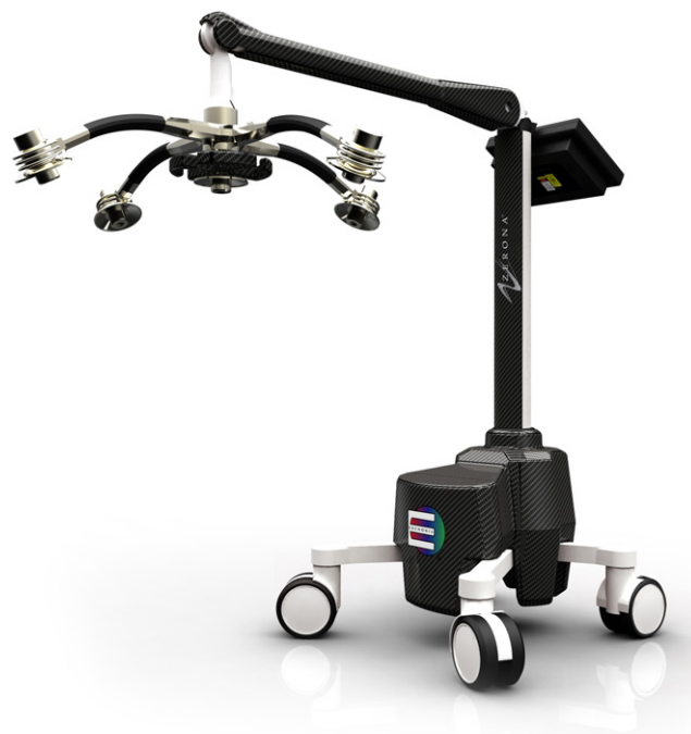
Figure 1 Zerona 635 nm LLLT Body Device.

Caruso-Davis et al 35 conducted a study to examine the clinical effectiveness by which 635-680-nm LLLT acts as a noninvasive body contouring intervention method. Results showed a statistically significant cumulative girth loss of -2.15 cm after eight 30-minute treatments over 4 weeks ( P < .05 ). As a secondary objective, in vitro assays were conducted to determine cell lysis and glycerol and triglyceride release. Three separate experiments were performed to evaluate whether fat loss was induced by irradiation with LLLT due to: (1) laser activation of the complement cascade, (2) laser-induced adipocyte death, or (3) laser-induced increased triglyceride release or lipolysis from adipocytes. Obtained from subcutaneous fat during abdominal surgery, human adipose-derived stem cells were plated and differentiated to form adipocytes. In the first experiment, results showed that serum complement lysed fat cells in both irradiated and nonirradiated adipocytes. Consequently, it was determined that LLLT does not activate the complement cascade to induce fat loss from adipocytes. In the second experiment,