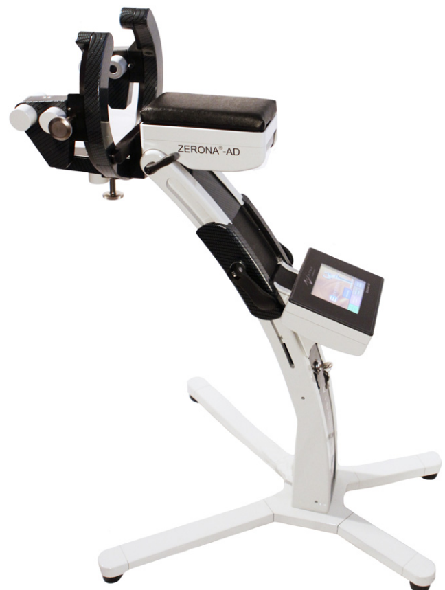
Figure 3 Zerona 635 nm LLLT Arm Device.

To fully evaluate the clinical efficacy of LLLT in a clinical model without significant confounding variables, Nestor et al 39 used an upper arm circumference model, and conducted a randomized double-blind study ( n = 40 ) in which patients received either three 20-minute LLLT (635-nm Zerona AD, Erchonia Corporation, McKinney, TX) (Fig. 3) or sham treatments each week for 2 weeks. The primary outcome measures were the number of subjects who achieved a total decrease in arm circumference \geq 1.25 cm for the 3 combined measurement points after 2 weeks of 3 treatments a week for a total of 6 treatments, as well as the average difference between the combined arm circumference measurements for the active versus sham treatment groups. Their results demonstrated that after 6 total treatments in 2 weeks, 12 subjects (60%) achieved a \geq 1.5 -cm decrease in upper arm circumference versus 0 (0%) in the sham treatment group, and showed a combined statistically significant reduction in arm circumference of -3.7 cm ( P < .0001 ) versus -0.2 cm. After the first week of treatment, which included 3 laser procedures, a 2.2-cm reduction in total circumference was observed, followed by a 3.7-cm reduction after the second week of 3 laser