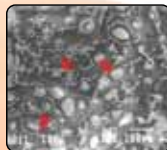
Complete collapse of adipose cell-emulsification